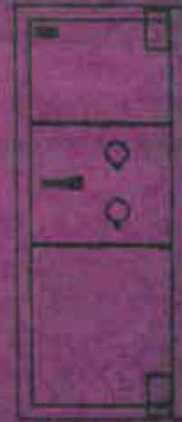
906 & 906ED*

* Model 906ED is the same as 906 except that the depth is increased. The internal depth is 900 mm instead of 420 mm. This increases the external depth dimension to 1,000 mm. This will require an overall size of 1,840 mm x 1,400 mm to accommodate the size of the door swing.