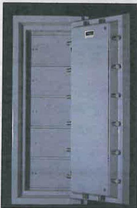
Above: The interior of the safe.

To ensure optimum security over long weekends, holidays or whenever the relevant executive staff may be absent an adjustable time-lock can be installed. This system maintains the door in a fully locked position even with the use of the correct keys and combinations until the pre-set time has elapsed. If necessary this period can be varied from one hour up to six days. In case of setting error, the device is fitted with a manual wind-back mechanism.