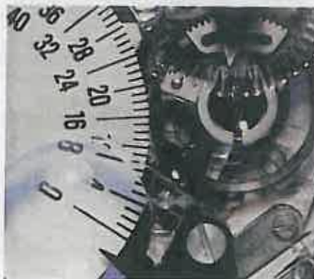
Below: Details of the 144 hour time-lock mechanism.